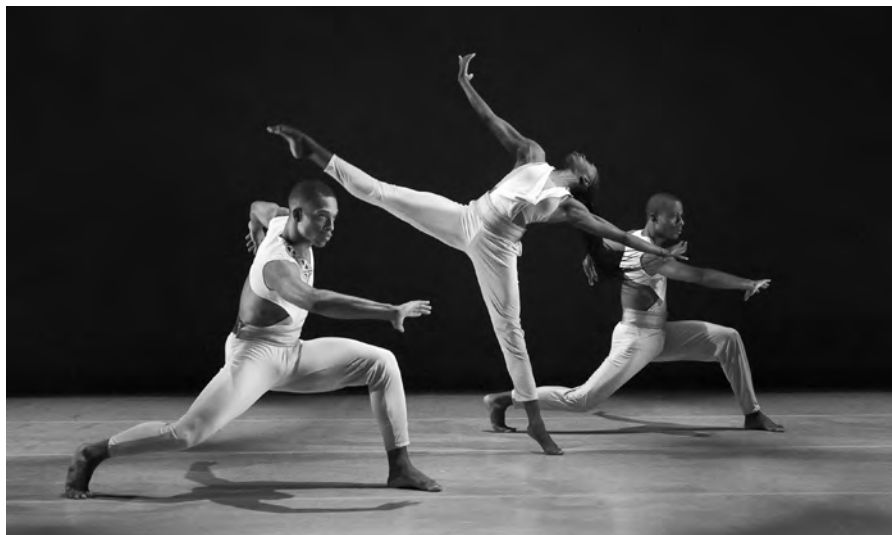
Ailey II in Touch & Agree.