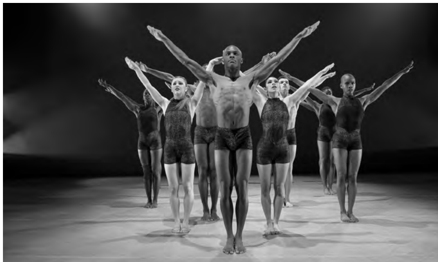
Ailey II in Breaking Point .