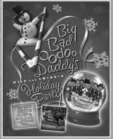
THURSDAY, DECEMBER 5 • 7 PM