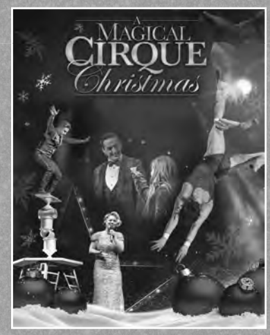
SUNDAY, DECEMBER 22 • 6 PM