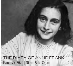
THE DIARY OF ANNE FRANK March 27, 2020 | 10 am & 12:30 pm