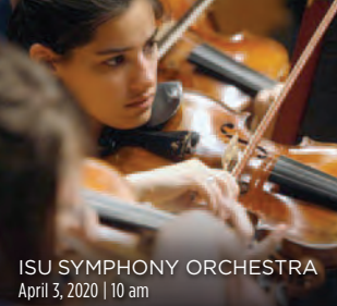
ISU SYMPHONY ORCHESTRA April 3, 2020 | 10 am