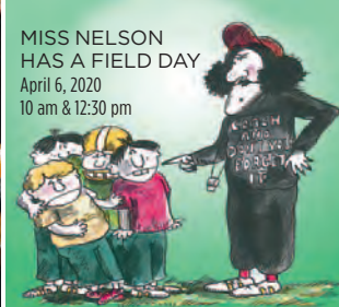
MISS NELSON HAS A FIELD DAY April 6, 2020 10 am & 12:30 pm

Martha-Ellen Tye Performing Arts Institute • For Pre-Kindergarten–Grade 12