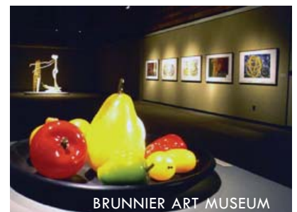
BRUNNIER ART MUSEUM

Brunnier Art Museum, located on the second floor of the Scheman Building, is Iowa’s only American Association of Museums (AAM) accredited museum emphasizing a decorative arts collection located within a performing arts and conference complex. Stop by to browse the Christian Petersen sculptures or other exhibitions. Looking for a unique gift? Try the museum gift shop.